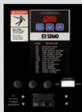
ADC RES Control panel accessible through the roof